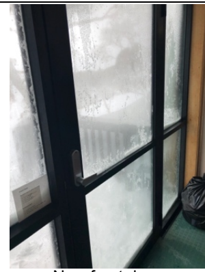
New front door.