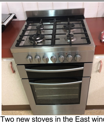
Two new stoves in the East wing featuring gas cooktops and electric ovens. Four more to follow.