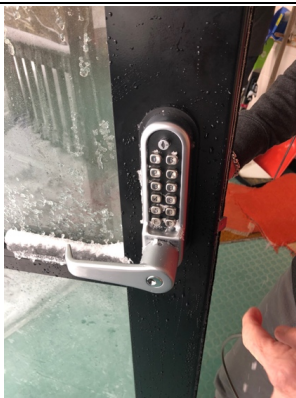
A new keyless front door. Improving lodge security & assisting with trades people access.

In addition to the examples below the following changes have simplified lodge usage: coin boxes have been removed from the dryers and washing machine and the phone is now free with the exception of international calls.