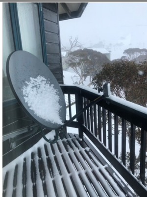
A 2018 addition. The NBN satellite dish providing free lodge WiFi.