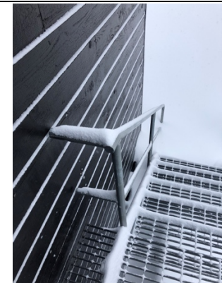
Rear fire stair safety rails