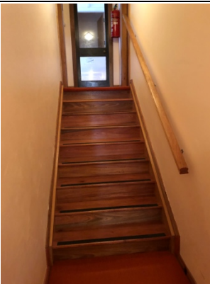
Extra head room for the taller members in the east wing; west wing to follow.