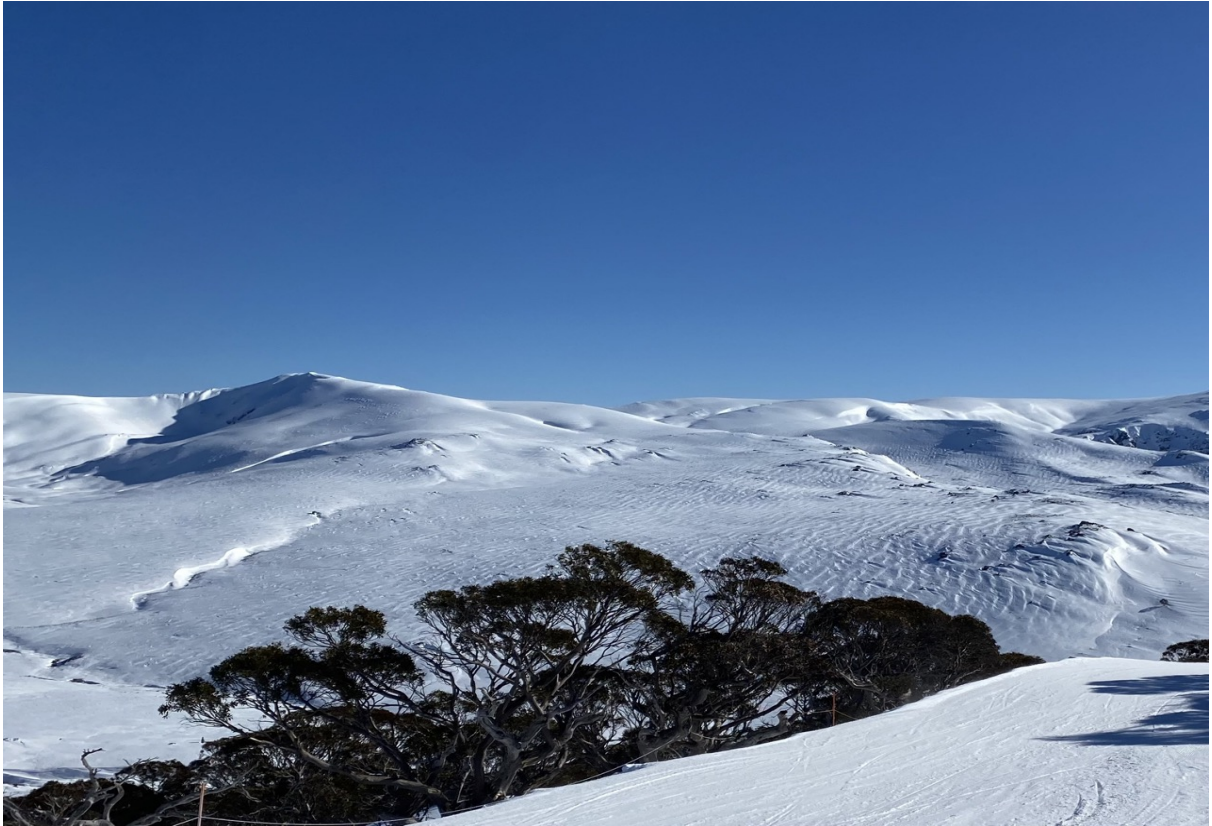
View from Waterfall looking towards Club Lake, Caruthers and the edge of Blue Lake Cliffs.