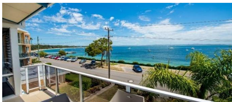
The stunning view (left) from our Unit over the bay.

Shoal Bay is home to some of the most beautiful beaches in Australia, perfect for swimming, paddleboarding, strolling the coastline, or snorkelling. This little village makes a fantastic base for exploring Port Stephens' natural attractions, including seeing koalas, dolphins and whales in the wild and going on walks that end in breathtaking views. The unit has four bedrooms and can accommodate 6-8 people, making it an ideal family destination.